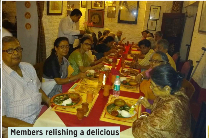
Members relishing a delicious lunch at Kewpies