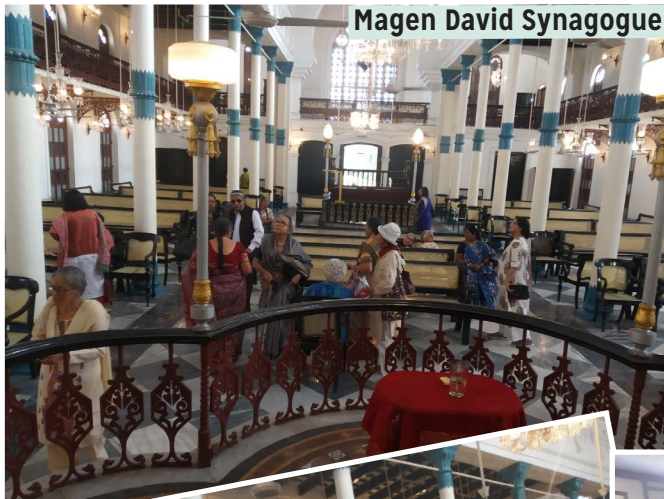
Magen David Synagogue