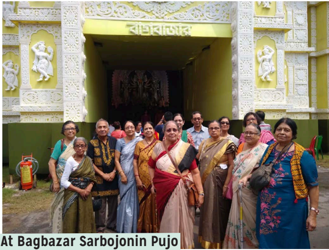
At Bagbazar Sarbojonin Pujo