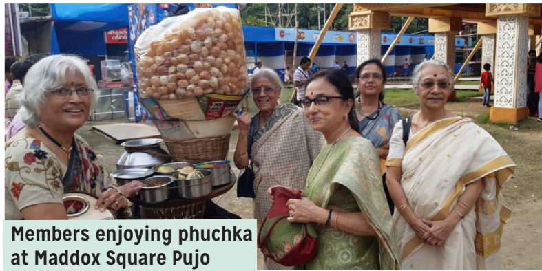
Members enjoying phuchka at Maddox Square Pujo