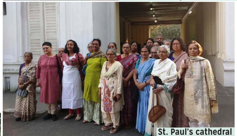
St. Paul's cathedral