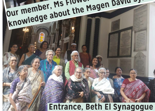
Entrance, Beth El Synagogue