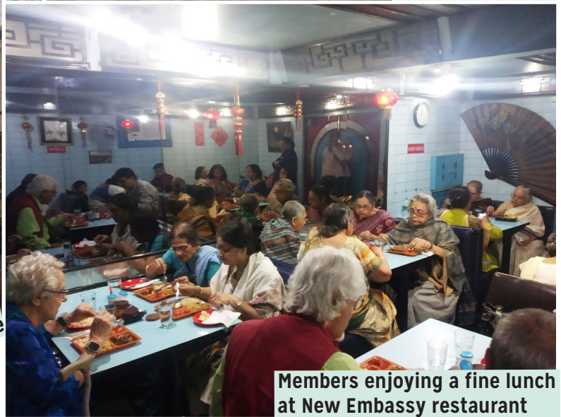
Members enjoying a fine lunch at New Embassy restaurant