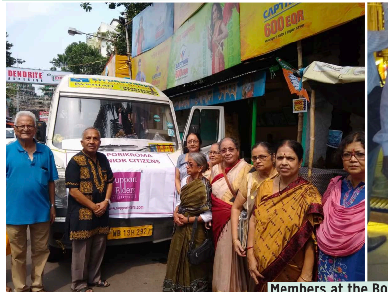
Members at the Bokul Bagan Pujo