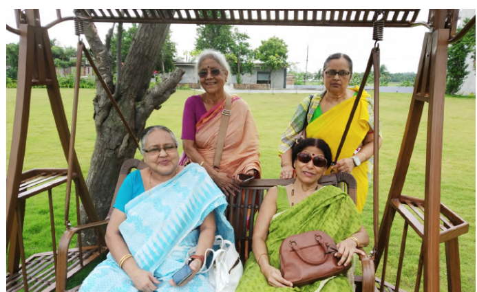
Hilsa Fest II - 20th August at CMIG Campus

It was a day-long picnic at the CMIG Campus, with members enjoying several kinds of Hilsa dishes. As members gathered, the place filled with music, adda, laughter and togetherness. Many of the members enjoyed cooking the various Hilsa dishes. Everybody enjoyed a great deal.