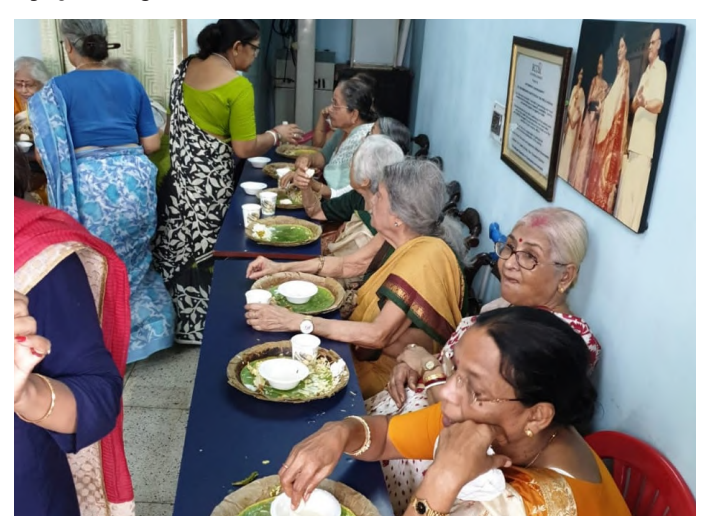
Hilsa Fest III - 30th August at Hotel Punyalakshmi

The jovial chitchat and music set the mood for the day, as we set off for Hotel Punyalakshmi. As we reached our destination, breakfast was served. After this members gathered under the riverside sheds. Adda and songs filled the air with joy and merriment. The sumptuous lunch included Bhapa Hilsa and Patoler Dorma. Everybody had a great time!